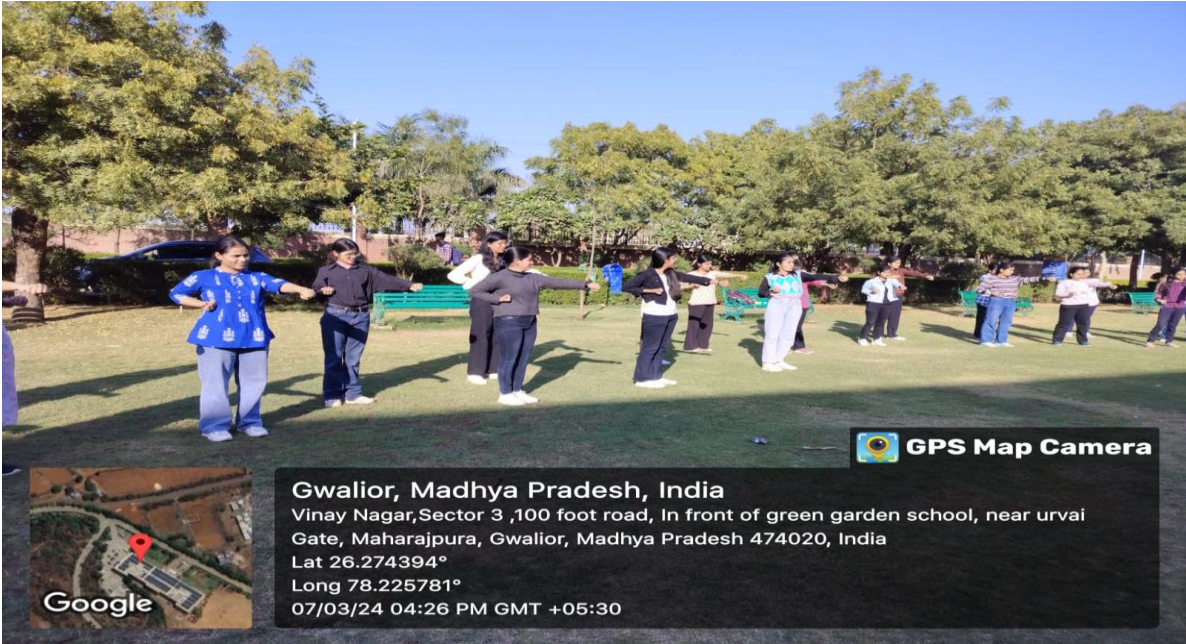
Self Defence Moves demonstrated by Expert