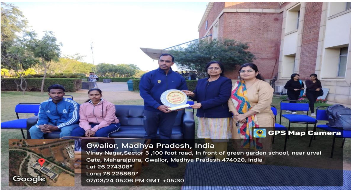
Felicitation of Memento to Expert