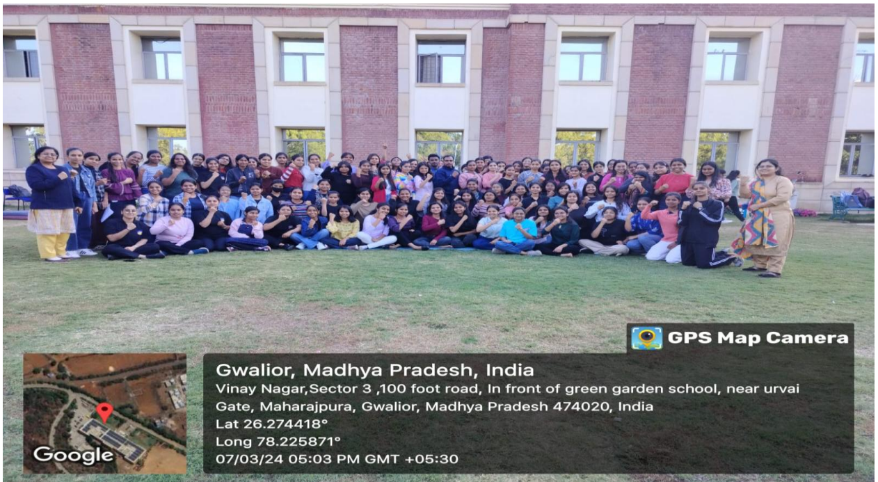
Self Defence Workshop of 80 girl students