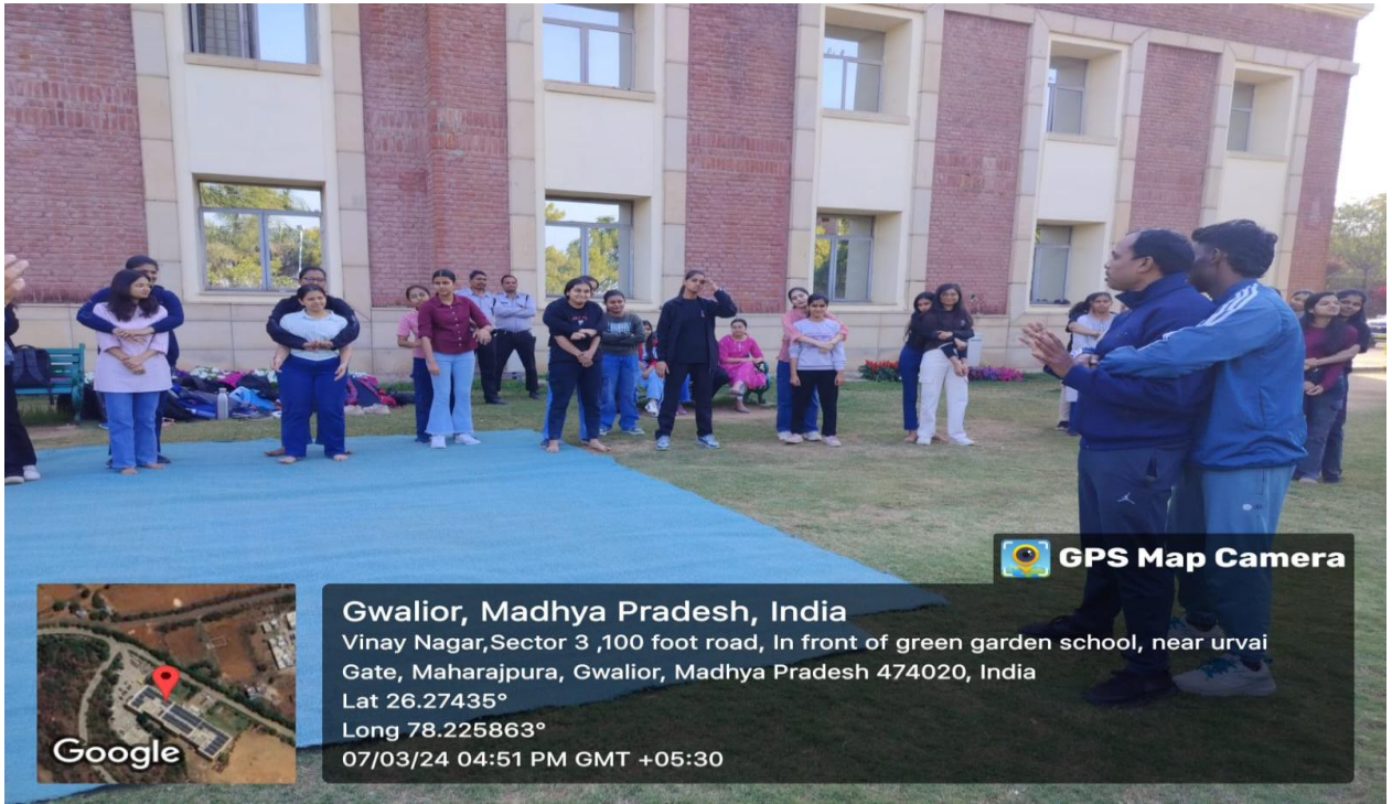
Self Defence Moves demonstrated by Expert